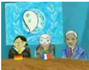
Kids have a voice against poverty