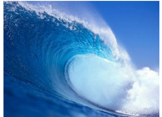
District 7610 Rotarians are already riding the wave of momentum to another successful year of TRF annual giving.

The six areas of focus under the Future Vision Plan are: Peace and conflict resolution and prevention Disease prevention and treatment Water and sanitation Maternal and child health