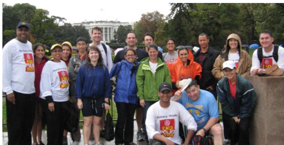
A wet, but dedicated, group of walkers end the Rotary Walk on the Ellipse in front of the White House in Washington, D.C.