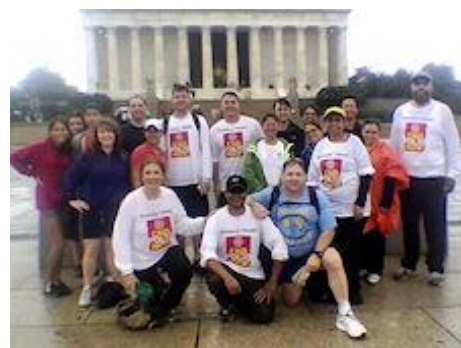
These walkers paused in the rain on their way to the White House for a photo in front of the Lincoln Memorial.

To date, almost $10,000 has been raised for Polio Plus because of Rotary Walk 2009. It means that more than 15,000 kids will receive polio vaccinations, which is no small feat.