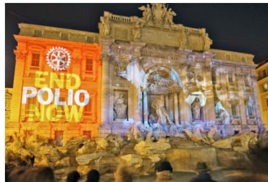
End Polio Now was projected at the Trevi Fountain in Rome (above) and onto the parliament building in The Hague (right).

Iconic landmarks around the world served as the backdrop for the End Polio Now message the week of February 23, in celebration of Rotary's 106th anniversary. They included the Trevi Fountain in Rome; a Lantern Festival gate in Taiwan; the parliament building in The Hague; the globe of the SM Mall of Asia in Manila, Philippines; the Bill and Melinda Gates