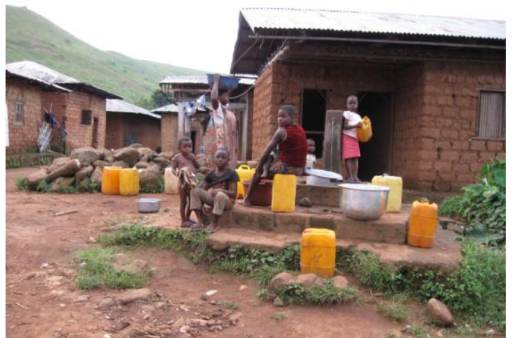
Current village water supplies are inadequate and unsafe, leading to 120 deaths per year, mainly among children.