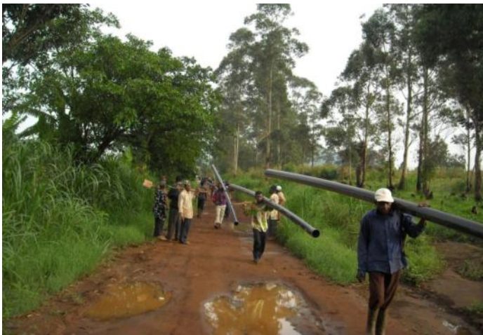
Wum Village residents carry lengths of water pipe to be installed as part of Phase I of the TRF-funded project.