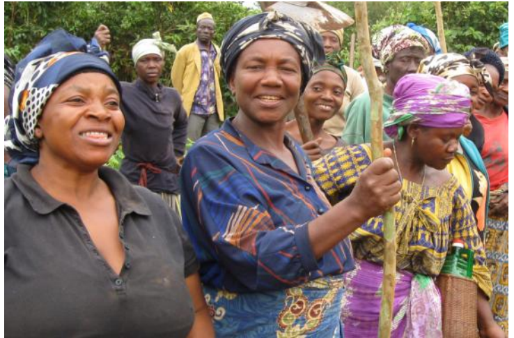
Wum Village residents celebrate the completion of Phase I of the water line project.

Recently, Phase I of the project was completed. Upon the completion of Phase I of the Cameroon Water Project—the installation of 2.3 miles of the 6.5 miles to the Village of Wum, Cameroon—the people of Wum celebrated. When completed, the water line will be a genuine life-line because it will eliminate the 120 deaths—mostly children—caused each year by Tetanus and Dysentery.