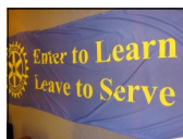
___ Enter to Learn, Leave to Serve Banner (white) horizontal 118'x42"