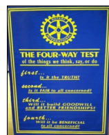
___ Four Way Test Banner—vertical 3'x5'