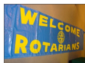
___ Welcome Rotarians (Canvas) horizontal, blue background 160'x35"