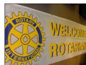
___ Welcome Rotarians (satin) horizontal, white background 36'x42"