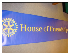
___ House of Friendship (Canvas) blue background, horizontal 103'x24"