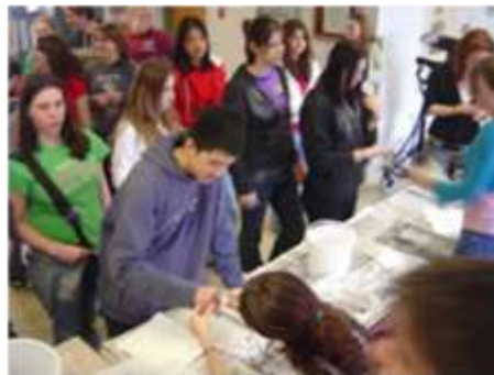
High school students wait in line to have their pinkies painted purple in support of Rotary's Global Polio Eradication Campaign.

The Club called upon its local elementary, middle, and high school students and Interact clubs to help raise funds to immunize other children from polio. When each student donated at least $1.00 (the approximate amount Rotary International estimates is needed for one immunization), Rotarians painted their pinkies purple with the same support of Rotary's Global Polio Eradication Campaign. Gentian Violet used throughout the world on eradication day as a symbol of one child saved from polio. Of course, more than one finger was painted as some students brought in multiples of $1.00.