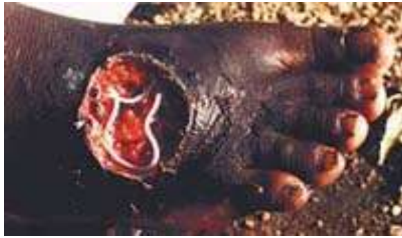
Click on the photo above and view an online video about the global effort to eradicate Guinea worm.

For all of recorded history, Guinea worm, a water-borne parasite, has caused crippling skin blisters from which the worms must be extracted in a painful procedure requiring each worm to be slowly pulled, inch by inch, from the blister and coiled around a stick each day for weeks. The disease was so prevalent in ancient history that some believe that the symbol for medicine—a snake wrapped around a stick—may be an early representation for Guinea worm extraction.